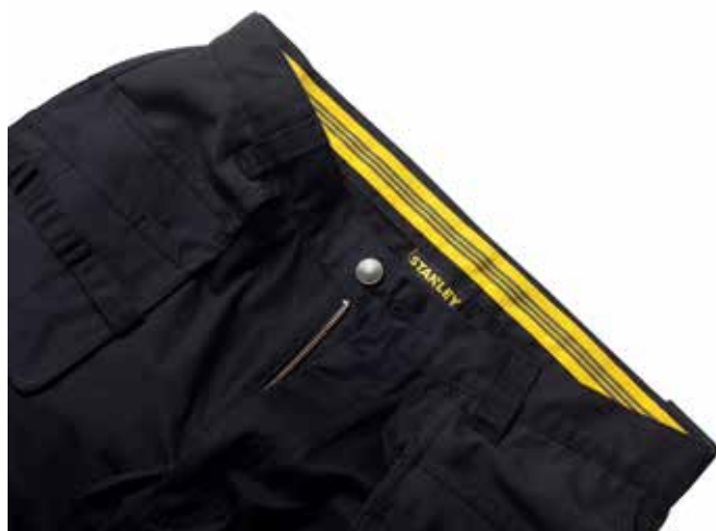
Rubberised gripper tape to internal waistband for extra comfort